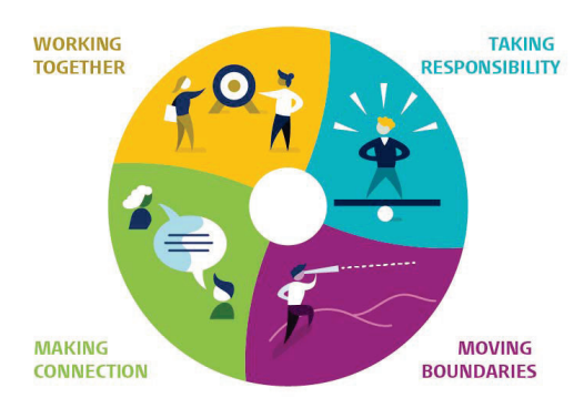
Leadership comptencies of Leiden University