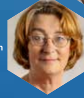
Wobine Buijs-Glaudemans Mayor of Oss, Gemeente Oss